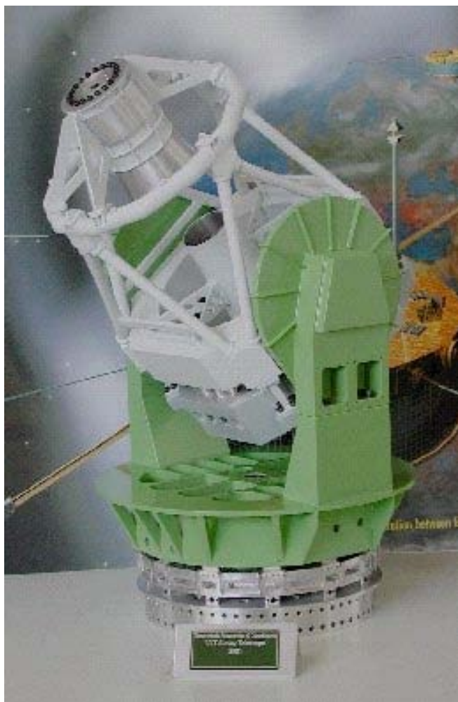
Figure 1. VST Telescope Model

cific subsystem, so the hardware devices are driven independently by different LCUs, using whenever possible the same VME boards and the same software. The programming languages on HP-UX platform are basically C++ for the core control modules, and Tcl/Tk for graphical user interface development. The LCU modules are developed in C. A key role in both workstation and LCU software architecture is played by an On Line Data Base, which allows the on-line information sharing between modules, monitoring the status of the system and of commands execution. Between the operating system and the application layer there is another software layer developed by ESO for VLT and reused for VST, the VLT Common Software, providing a lot of utilities, tools and common services to the application programmer.