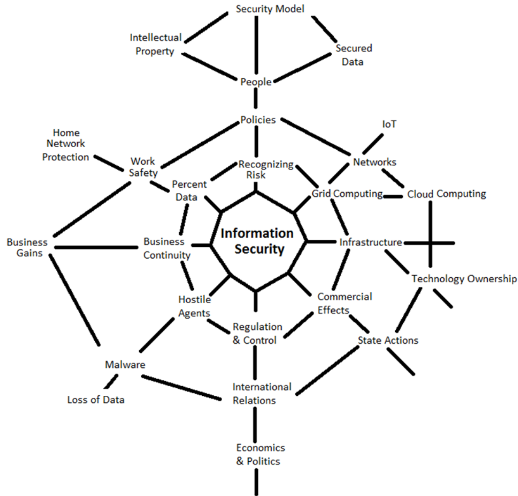
Figure 1. Spider-web draw-out for Information Security.

emerge naturally and begin to excite and engage the students. After a review of various technology tools, an educational version of a unique webspaces called KPortals was licensed from a commercial company for use in the MIS class. A complimentary educational license permitted the use of a KPortal webspaces called Cyberbriefs ( www.cyberbriefs.org ) to be custom designed for the course and allowed the dynamic aggregation of content from various sources such as news, social media, video, books, and articles, quite unlike the typical LMS. A view of the website is provided in the Appendix. The webspaces is accompanied by a mobile app to push content to the students.