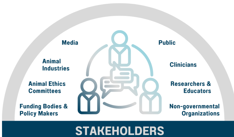
Fig. 1: Stakeholders in the use of animal methods, as identified by workshop participants

Researchers and publishers (including editors and reviewers) have already been widely mentioned as stakeholders in the use of animal methods, but the people carrying out this bias and those affected by it are not limited to these two groups. Participants identified other important actors like funding bodies, policy makers, companies in animal supply chains, as well as powerful and established industries using animals, the press and media, and the public (Fig. 1).