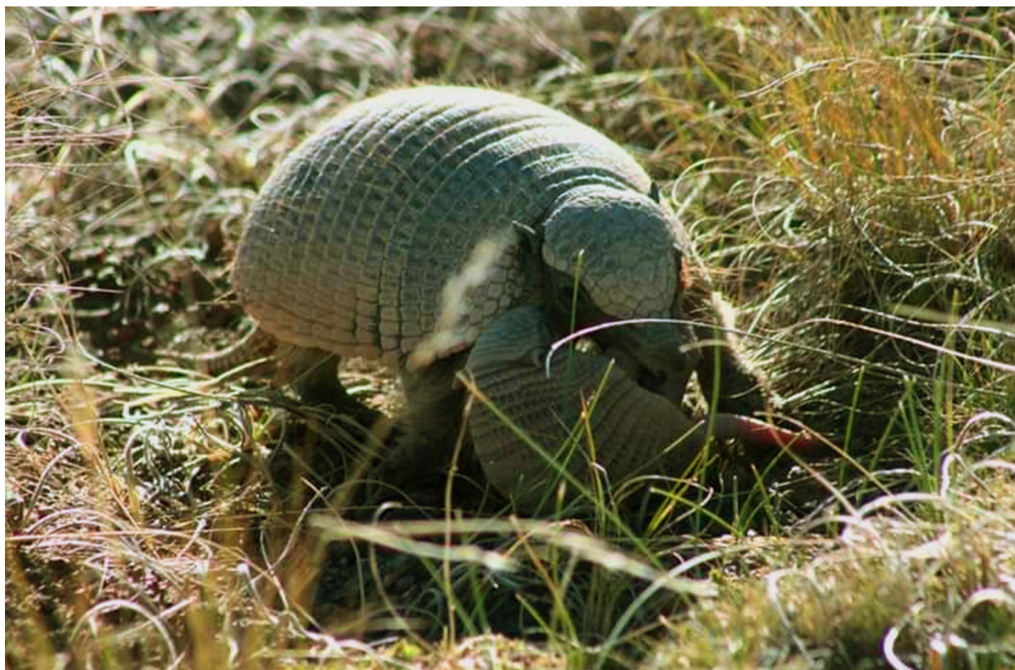
Figure 2. Zaedyus pichiy adult carrying offspring in La Payunia reserve (Mendoza, Argentina).

Due to all cases are temporally and geographically disconnected and were observed in different ecoregions and species, this behavior could be widespread and part of the usual repertoire of behaviors of the species rather than rare occurrences. The carrying behavior reported here, along with reports for the yellow armadillo (Poma-Urey and Miserendino-Salazar 2014) and Tolypeutes matacus (in captivity at Zooborns, Edinburgh; see Zooborns 2016) constitute strong evidence that parental care in armadillos may be more complex than previously thought and probably extends to at least 3 months of age.