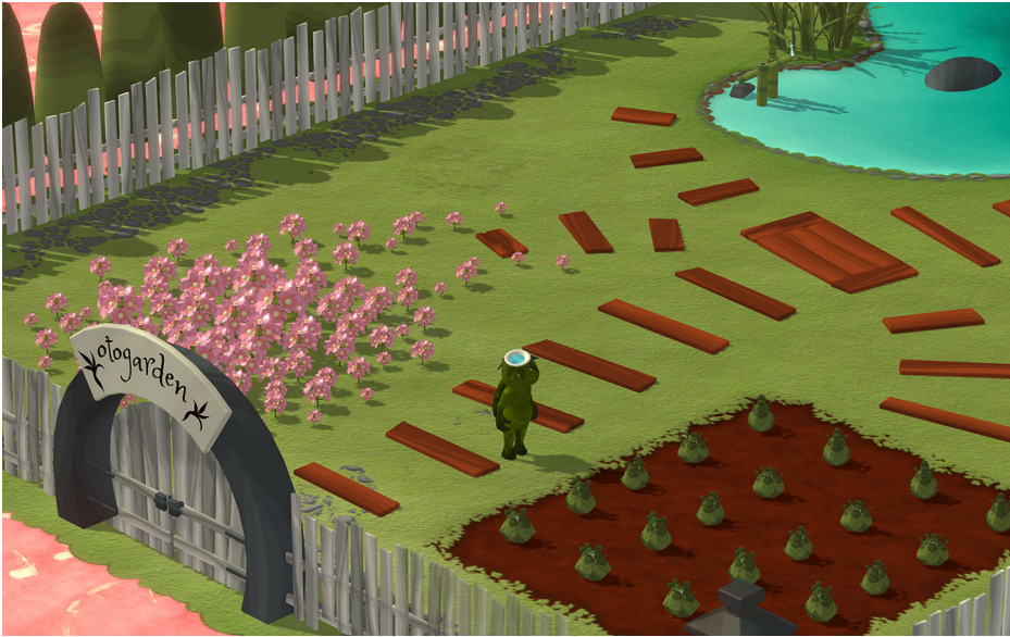
FIGURE 4. Otogarden.

a key on their input devices to trigger a loop game mechanic. In that case, keeping the button pushed will effectively “record” the players’ movements, reproducing them immediately as the button is released. The loop generates a “ghost” of the kappa, so to speak, which continues to repeat its movements. While the length of the loop is set at a duration of eight seconds, there is no limit to the number of possible concurrent loops; players can therefore choose to juxtapose a few longer loops or numerous shorter ones. The garden elements that trigger sounds are arranged at a certain distance from each other, so as to render possible juxtaposing loops with all the available sounds, provided that players are committed to making a concerted effort and running with a rather specific purpose. In any case, such acoustic juxtapositions last for just a few seconds, considering the relatively short loop length. The game has no “end state” or discernible conclusion, and players are free to play as long as they deem appropriate.