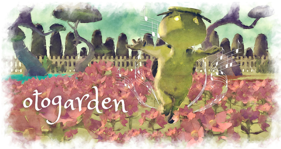
FIGURE 1. Otogarden illustration (author: Fabrizio Cali).

Otogarden as well as general issues related to musical improvisation within the context of video games. In addition, the game is addressed in regard to its application in an educational context.