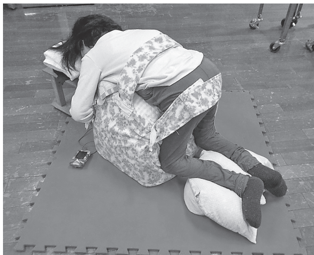
Fig. 1 Device for prone position.

Prone position. Since patients with CP find it difficult to lay in a prone position on a flat surface due to joint contractures and limb and trunk deformities, a custom-made device that accounts for their individual body structures was used to support the prone position (Fig. 1). The device, used to hold the front of the trunk, is essentially a styrofoam cube with a height of about 40 inches. The surface of the device in contact with the body is padded with a urethane cushion. In addition, a wooden stand with cushioning material is used to support the head.