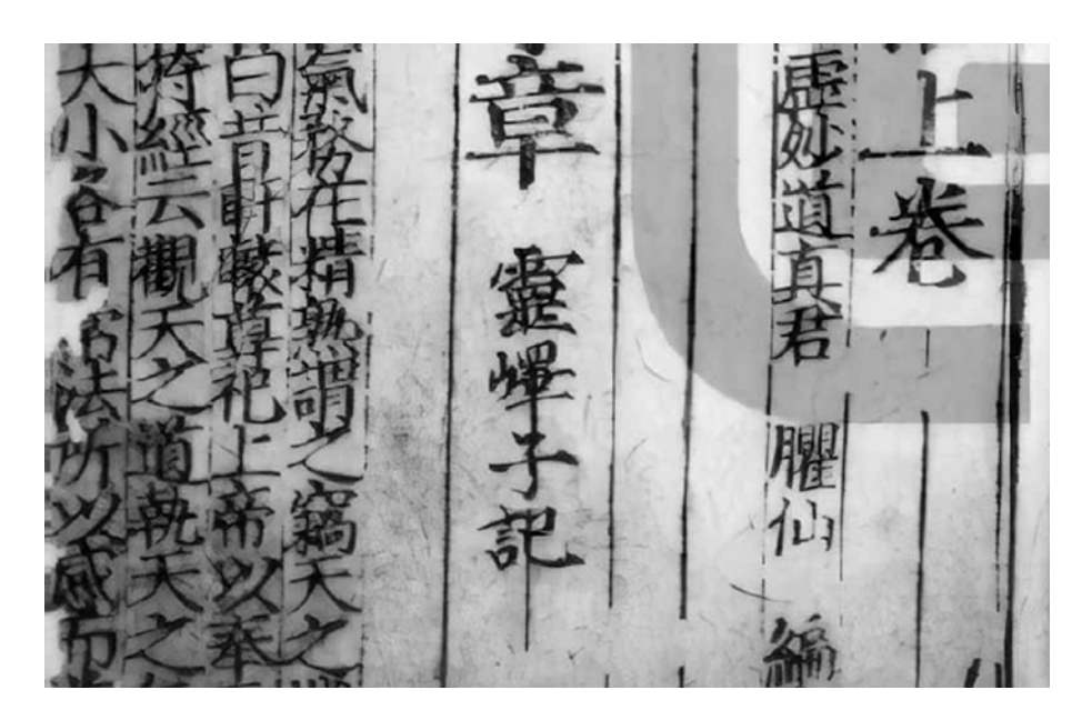
Fig. 2 - Paratext Recording Lingyizi's 靈嶧子 Editorship of E1.