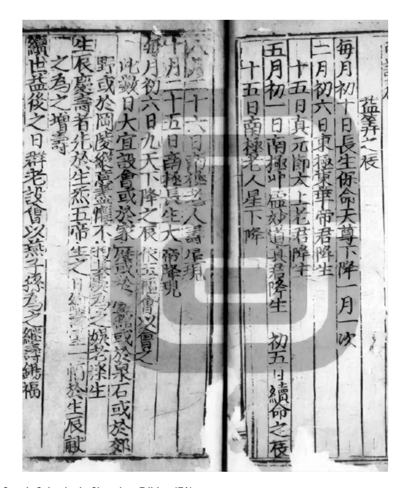
Fig. 4 - Zhu Quan's Calendar in Chenghua Edition (E1).

tions Xu's sacred birth, which takes place on the twenty-eighth day of the first lunar month, <sup>117</sup> as well as his ascension on the traditional date seen in early hagiographies, i.e., the fifteenth day of the eighth month. <sup>118</sup> The calendar seen in the Pivot , on the other hand, focuses on the manifestations of the Southern Pole. In both calendars, nevertheless, Zhu Quan's image as a god seems to parallel the profile of his intended audience, for both the Perfected Lord and his implied readers are elderly gentlemen of elite background.