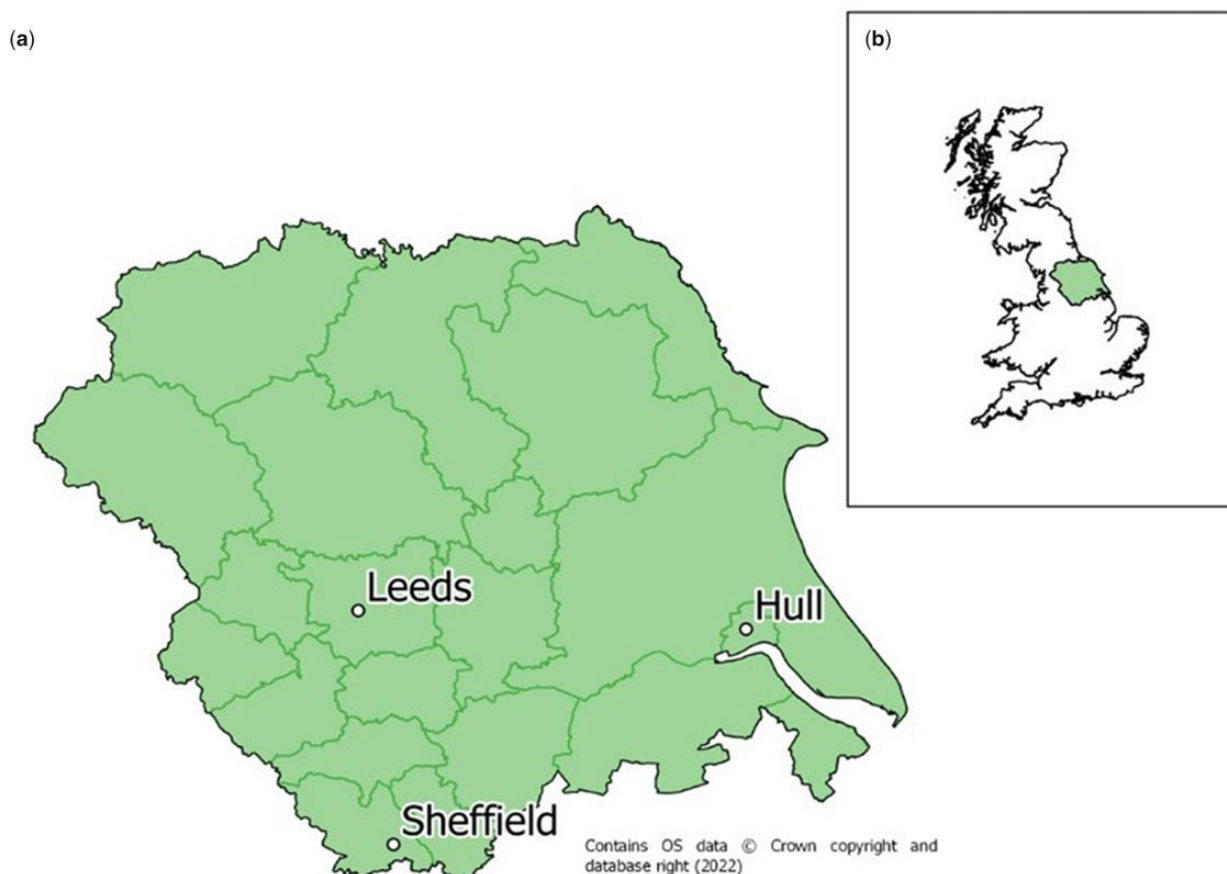
Figure 1 Yorkshire Specialist Register of Children and Young People (Yorkshire Register) population coverage. (a) Map of Yorkshire & the Humber; (b) map of the UK with Yorkshire & the Humber highlighted.

teenage and young-adult multidisciplinary teams at LTHT and Sheffield Teaching Hospitals NHS Foundation Trust. For all other ages (25–29 years), the primary source of notifications is NCRAS. An electronic feed has been established from local hospital patient management and pathology systems [including Patient Pathway Manager (PPM) 18 in Leeds, with a view to expand across all NHS Trusts across Yorkshire], as well as NCRAS 5 to improve the efficiency of the Yorkshire Register data collection. The Neuropathology department at LTHT provides an additional secondary source of notifications for all 0- to 29-year-olds referred for diagnosis and/or treatment and the Haematological Malignancy Diagnostic Service for all haematological tumours (Figure 2). Where essential data on cancer diagnosis and treatment are missing or incomplete from the electronic data sources, information is manually abstracted from local hospital notes and patient management systems. Yorkshire Register data are cross-checked annually and validated against other data sets held by the NCRAS 5 for the purposes of quality assurance.