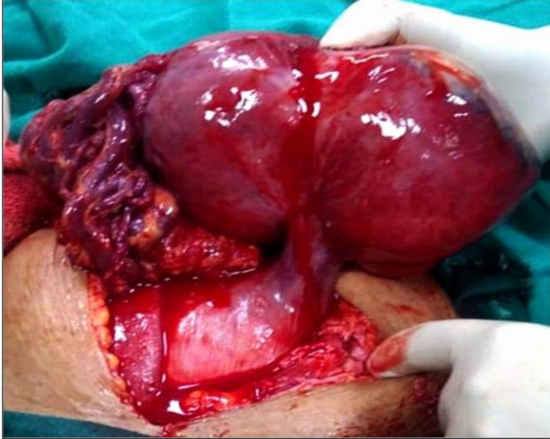
Figure 2: Intra-operative findings confirmed large pedunculated fibroid uterus with attached large bore feeding vessels from omentum.

She gave history of primary infertility for that she was investigated and incidentally diagnosed with asymptomatic multiple intramural fibroids uterus 6 years back. She conceived spontaneously and had normal vaginal delivery 2½ year back. Her medical and family history was not significant.