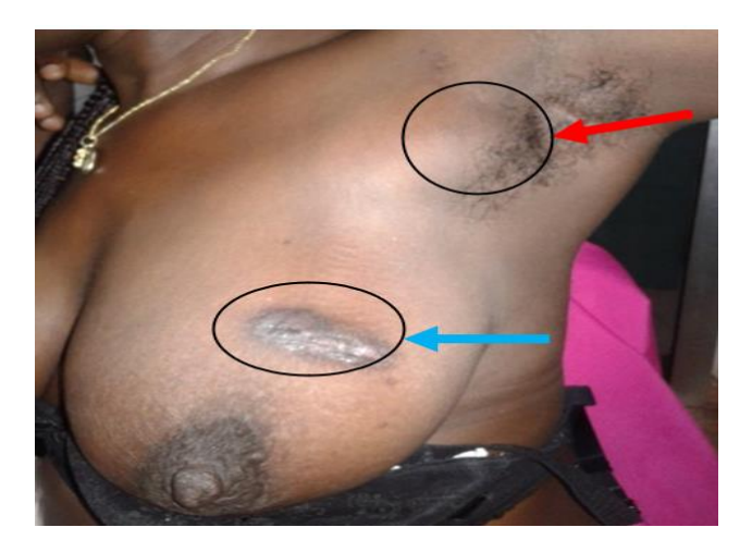
Figure 1: Axillary lymph node shows (red arrow), 2breast fistula (blue arrow).

clinical signs and a normal mammography and ultrasound results.