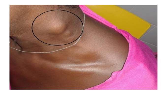
Figure 2: Cervical lymph nodes.