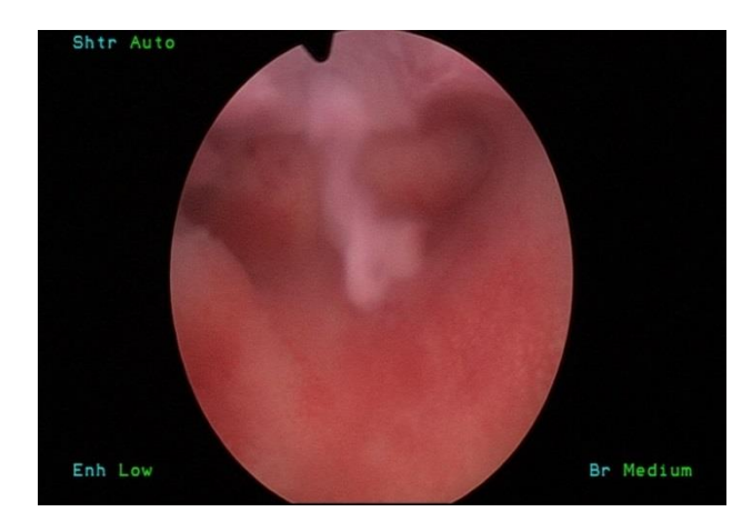
Figure 2: Hysteroscopy showing empty uterus.