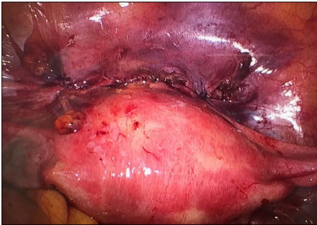
Figure 1: Intra-operative view showing uterus (bulky), bilateral ovaries and fallopian tubes (normal).

Patient was taken up for surgery under general anaesthesia. Peritoneal access was gained by standard port placement. A bulky uterus with bulging anterior wall was noted. Urinary bladder was adherent to lower segment. Bilateral ovaries and fallopian tubes were normal.