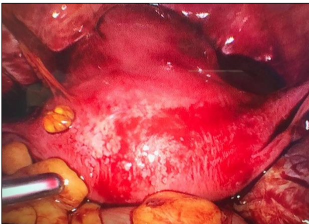
Figure 2: Bulging anterior uterine wall indicating site of CSEP. Urinary bladder is adherent to anterior uterine wall.

Uterovesical fold of peritoneum was opened and sharp dissection was done to free the urinary bladder from anterior myometrium. Previous cesarean scar was