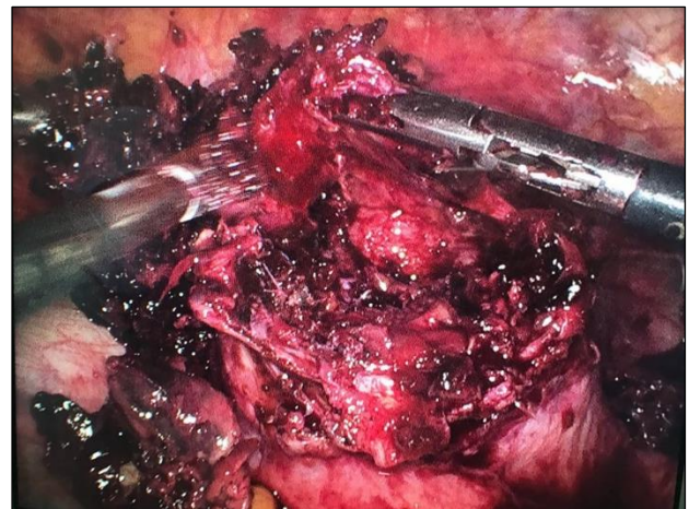
Figure 4: After opening anterior myometrium-gestational sac with hematoma and macerated products of conception adherent to uterus.