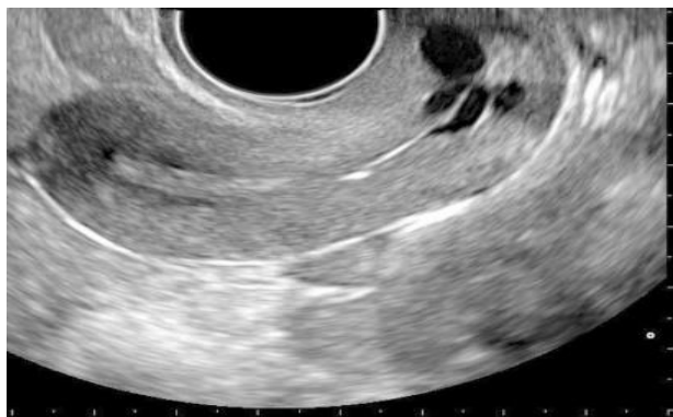
Figure 1: Big nabothian cyst (USG).

Tunnel clusters and endocervical glandular hyperplasia are distinguished by histological diagnosis. Nabothian cysts are usually small spanning a few millimetres in diameter but on occasion, have been reported reach extreme sizes of up to 4 cm. Deep nabothian cysts are uncommon nonneoplastic lesions of the cervix. 7