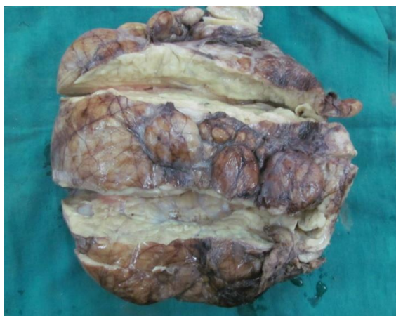
Figure 1: Gross picture of the retroperitoneal mass.

Exploratory laparotomy was done under general anaesthesia. On laparotomy, it revealed a huge fatty mass involving almost the whole abdominal cavity and encroaching to pelvic cavity. Surprisingly no visceral involvement was noted during surgery. The entire tumour mass was resected and sent for histopathological examination. She responded well to post-operative care and after 6 month follow up she was free from any recurrence. On gross examination, it was a well circumscribed large soft tumour mass measuring (30×26×20) cm in size and weighting 27.5kg (Figure 1). Cut surface of the tumour was yellowish fatty and radiating fibrous septa were found at central portion. No area of haemorrhage and necrosis was seen in the tumour mass. Microscopy from different parts of the tumour show admixture of large round shaped adipocytes, spindle cells and large pleomorphic multinucleated giant cells having bizarre, hyperchromatic, scalloped nuclei and perinuclear vacuolated cytoplasm (pleomorphic lipoblasts) (Figure 2 & 3). Histopathological diagnosis of pleomorphic liposarcoma was made.