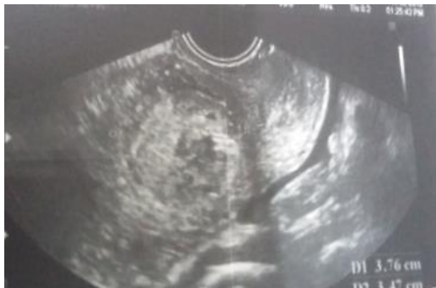
Figure 2: Heterogeneous mass at scar site suggestive of haematoma.

Eight women received systemic methotrexate out of which five cases had resolution, three women required surgical management, two women required surgical evacuation with intrauterine tamponade, and one woman needed hysterectomy for uncontrolled haemorrhage. Five women