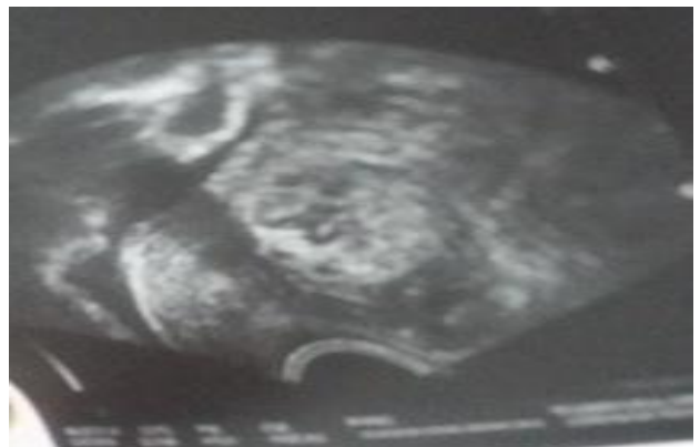
Figure 4: Collection of clots at scar site.