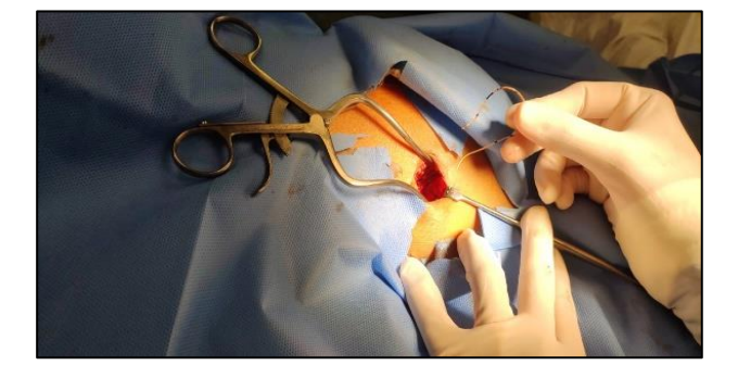
Figure 2: Removal of ACB catheter fragment.