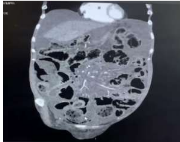
Figure 2: Coronal section of perihepatic and perisplenic fluid and diffuse intestinal involvement in relation to intestinal pneumatosis.