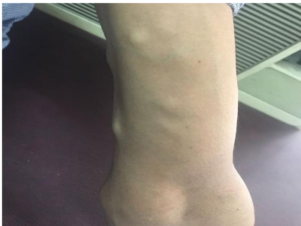
Figure 2: Multiple swellings seen on forearm.

On examination multiple swellings were seen all over the body, largest measuring 2x2 cm and smallest measuring 0.5x0.5 cm in size. They were soft in consistency and were well circumscribed. Systemic examination was within normal limits. There was no apparent deficit in attention, orientation, memory, and judgment. Routine hemogram showed normal haemoglobin and normal