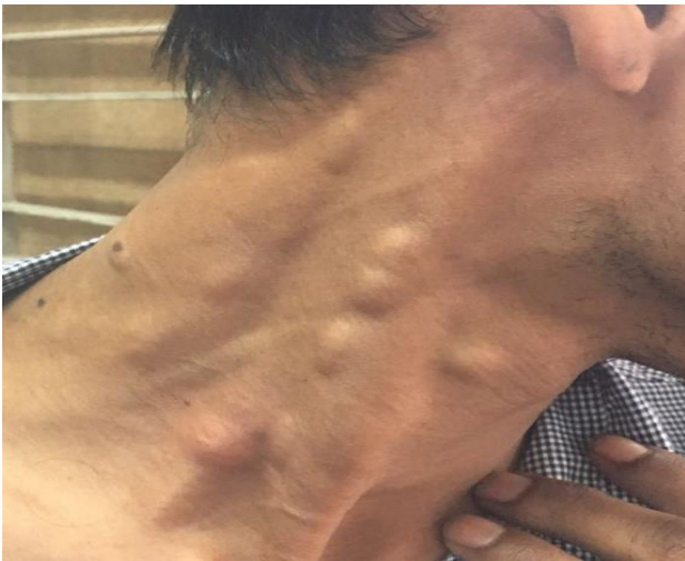
Figure 1: Patient with swellings seen on the side of neck.

A 26 year old male came to surgery OPD with a complaint of multiple swellings all over the body including the tongue, neck, arms, legs, back and the abdomen (Figure 1,2). He also had a history of seizures for 2 years. He was a non-vegetarian and consumed pork and meat regularly. There was no history of chronic cough, chronic diarrhoea, weight loss, decreased appetite or any past history suggestive of diabetes, hypertension and tuberculosis.