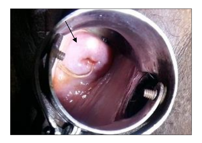
Figure 1: Nabothian like protrusion of vertical limb of IUCD from anterior lip of cervix.

A 22-year-old female P1L1 presented in family planning OPD of Safdarjung hospital, with complaints of prolonged cycles and lower abdominal pain since last two months. She had history of IUCD insertion.