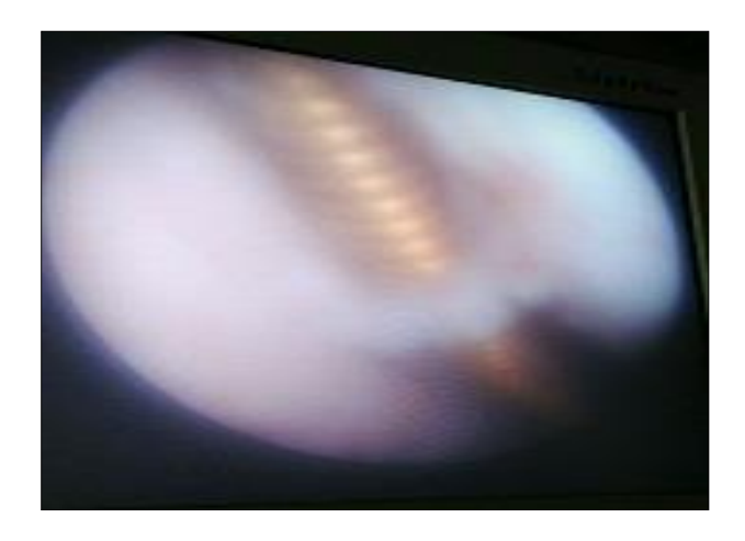
Figure 2: Vertical limb of IUCD getting embedded into the anterior lip of cervix (hysteroscopic view).