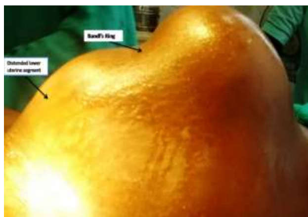
Figure 1: Signs of obstructed labour, bandl's Ring and distended lower uterine segment.

In the other case, a patient was induced with oxytocin at 39 weeks of gestation and had rupture of her anterior vaginal wall and posterior bladder wall, during prolonged second stage. 8