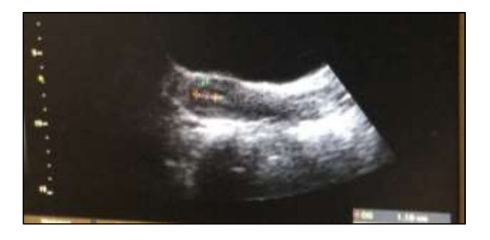
Figure 3: Measurement of embryo fundal distance after embryo transfer.