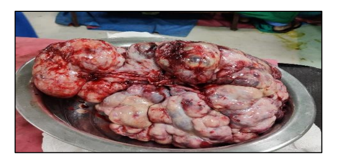
Figure 4: Gross excised specimen weighing 7.5 kg.

lymphadenopathy were noted. Post-operative tumour markers were done and elevated (LDH-294U/L, beta-HCG-2.95mIU/mL) but were reduced as compare to preoperative values. According to the protocol patient was planned for 3 cycles of BEP (Bleomycin, etoposide, cisplatin) at higher centre.