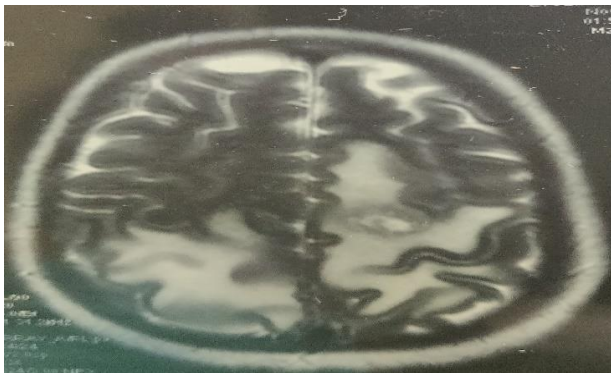
Figure 2: MRI brain of 50-year-old patient of ca cervix suggested of multifocal thick walled well defined T2/FLAIR hyperintense lesion largest 20×17 mm and 16×14 mm in right parietal and left frontal lobe. Patient was on follow up post treatment of ca cervix and presented 2.5 years later with c/o right sided upper and lower limb weakness.

Chest-X-ray and routine blood investigations were within normal limits. Detailed histopathological examination (HPE) revealed bulky tumor (4.8×4 cm) deep stromal invasion and patient was given chemoradiotherapy (CRT) 50 Gy/25#/5 weeks along with weekly cisplatin followed by two sessions of intra vaginal brachytherapy 7 Gy mucosal dose at 0.5 cm in two sessions one week apart and was kept on F/u. She was asymptomatic on follow up for 2.5 years and then presented with c/o right sided upper and lower limb weakness, gradually progressive. Magnetic resonance imaging (MRI) brain was suggested of