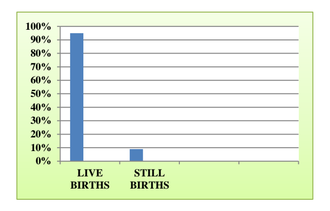
Figure 3: Neonatal outcome at MGMGH.

Table 5 shows postpartum complications that occurred in teenage pregnancy Primary PPH 36(15.1%), Puerperal sepsis 5(2%), Retained placenta 1(0.4%).