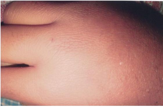
Figure 1: Local swelling and ecchymosis at the site of viper bite.

In the very next day the patient developed left sided hemiparesis with upper motor neuron type of facial palsy. Power in the left upper and lower limbs was 3/5 and 4/5 respectively. CT scan revealed large infarct involving right middle cerebral artery territory (Figure 2). Hematological parameters revealed features of Disseminated Intravascular Coagulation (DIC), Platelet-60000/dl, prothombin time - 30 sec (Normal - 12 seconds), APTT -60 seconds (Normal 25-35 seconds). Fibrin degradation product value was >40 µg/dl (Normal <5µg/ml). Echocardiogram was normal. Patient was shifted to critical care unit, managed conservatively and hemodialysis continued until improvement of renal function. At the time of discharge there was mild residual weakness in his left half of body (power of left upper and lower limb 4/5), normal coagulation profile and negative lupus anticoagulant test. Doppler study of carotid and vertebral system, MR angiogram of extra and intra cranial arterial system (performed after normalization of renal function) turned out to be normal. In the absence of other possible precipitants of DIC, snake bite was considered as the culprit event and thrombotic manifestation of DIC dominated the clinical spectrum.