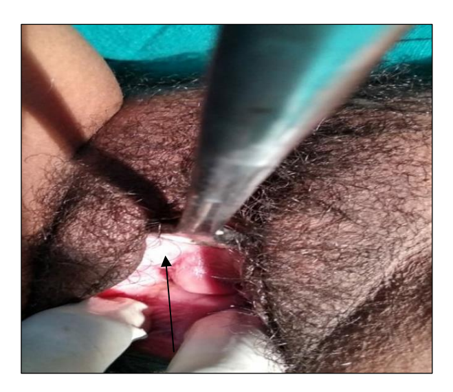
Figure 2: Arrow showing one septa between two separate vagina retracted by ant vaginal wall retracter.