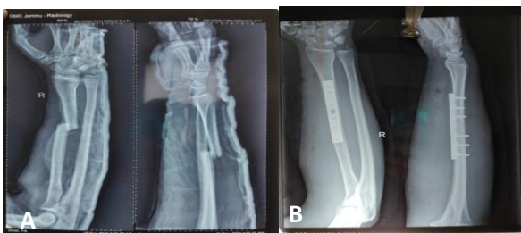
Figure 1: Pre-operative and post-operative radiographs of a 24-year-old-male with galeazzi fracture dislocation.

All cases were managed with open reduction and internal fixation with plating by anterior Henry approach. All operations were performed under general anaesthesia and Supraclavicular Block. Tourniquet was used in all cases and was inflated prior to incision. The landmarks were the radial head or lateral to the biceps tendon proximally to the radial styloid distally.