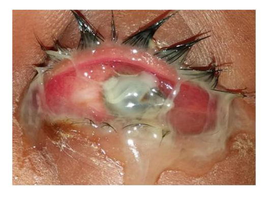
Figure 2: Endophthalmitis following penetrating injury.