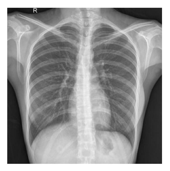
Figure 2: Chest X-ray showing no abnormal findings.

The patient was advised complete blood count along with peripheral film and chest X-ray. The complete blood profile showed the increased white cell count. This is explained in Table 1. This increased white cell count correlated with his recent COVID-19 infection. Furthermore, peripheral film and chest X-ray revealed no