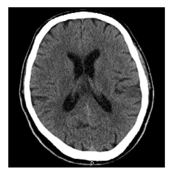
Figure 3: CT scan brain showing no abnormal findings.

pathology. This is exhibited in Figure 2. Keeping in view of his recent respiratory tract infection, the provisional diagnosis of GBS was made and he was referred to tertiary care hospital (Nishtar hospital, Multan, Pakistan) for further evaluation and management.