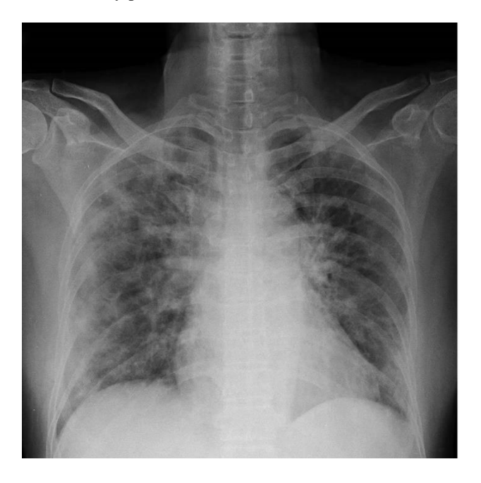
Figure 1: Chest X-ray showing bilateral lungs infiltrates suggestive of viral (COVID-19) infection.

examination concluded no other neurological, autonomic or orthopedic findings. The other systemic examination (cardiovascular, respiratory, gastrointestinal and genitourinary) were completely normal. Furthermore, he was a healthy person with no comorbidities.