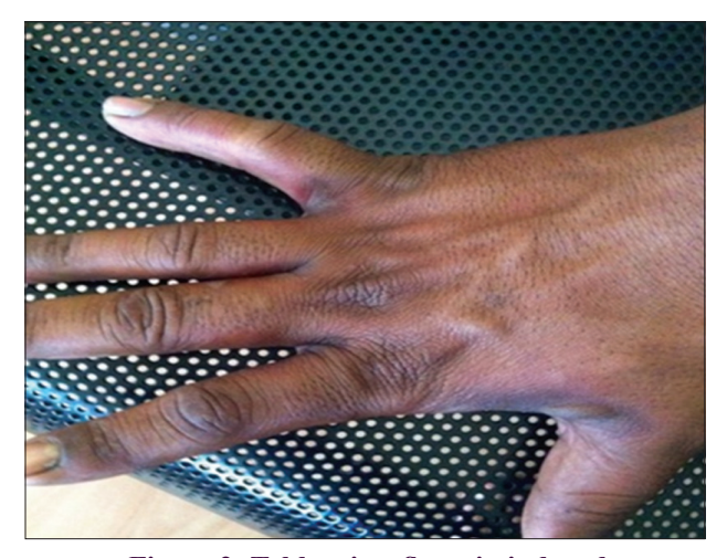
Figure 2: Tablet ciprofloxacin induced hyperpigmentation.

are relatively few, and development of resistance by microbes is also rare. It is used in infections of urinary tract, respiratory tract, bones and soft tissues. A few cases of ciprofloxacin-induced photosensitivity, hypersensitivity, anaphylaxis, vasculitis, erythema multiforme or toxic epidermal necrolysis have been reported so far.<sup>6</sup> FDE to ciprofloxacin is rarely reported.