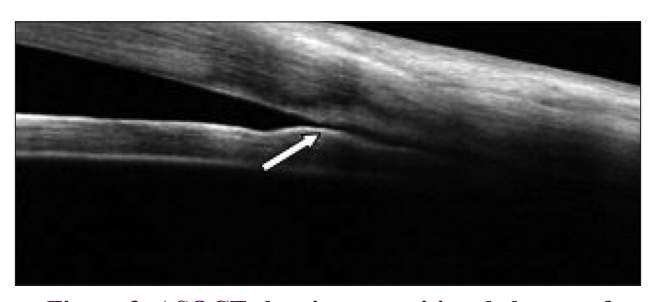
Figure 3: ASOCT showing appositional closure of angle.

Fundus of both eyes was unremarkable with normal optic disc and healthy rim tissue with the cup to disc ratio of (0.2-0.3). The diagnosis of bilateral secondary AACG due to TPM was made. IOP spikes were lowered down with intravenous mannitol, topical aqueous suppressants. cycloplegics, and oral hyperosmotics. After 2 days, patient was comfortable with partial resolution of symptoms. Anterior chamber remained shallow with resolution of corneal edema and decreased IOP. After 1 week, unaided vision acuity was recorded 20/20 for both eyes and cycloplegic retinoscopy revealed -0.75D sphere right eve and -0.5D sphere left eye. IOP was 14 mmHg and 16 mmHg for right and left eye, respectively; anterior chambers became deep and corneas clear. After normalization, IOP gonioscopy revealed bilateral open angles and several small bilateral peripheral anterior synechiae. The treatment of glaucoma was gradually tapered off and completely stopped within about next 15 days, and no further rechallenge test with TPM was given considering higher risk/benefit ratio as it involved potentially sight threatening complication with permanent loss of vision. The possibilities of other drugs causing angle closure glaucoma were unlikely as they continued during the course of treatment and TPM was the only drug which was stopped, leading to attenuation of symptoms.