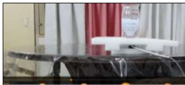
Figure 2: At 0:47 second the concentration of drug X is 2C.