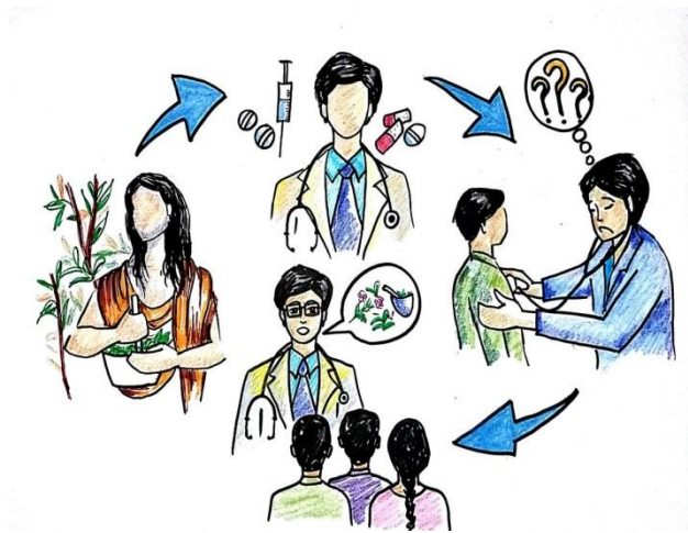
Figure 1: Teaching ethnopharmacology to students of modern medicine.

not find importance and proper way of andragogic delivery of the natural sources of drugs to the future prescribers of modern system of medicine (Figure 1). This may needs innovative teaching and hard work by the trainer.