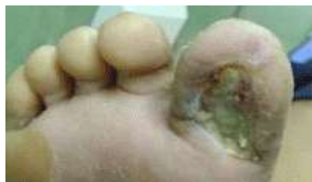
Figure 2: A case of diabetic foot ulcer at the time of admission in surgery ward of government medical college, Patiala.

derived growth factor \beta chain in macrophage and monocytes. 10,11