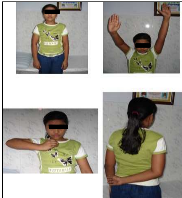
Figure 2: 9 years follow up in upper arm type OBPP.

Statistical analysis of our functional results was done using student ‘t’ distribution series. The ‘p’ values of difference in the pre-operative and the post-operative range of both abduction and external rotation were evaluated. The ‘p’ values were 0.00006 and 0.015 for the abduction and external rotation respectively for the children affected with upper arm type of involvement. These values are significant as they are well below 0.05. The ‘p’ values were not significant in the children affected with whole arm type.