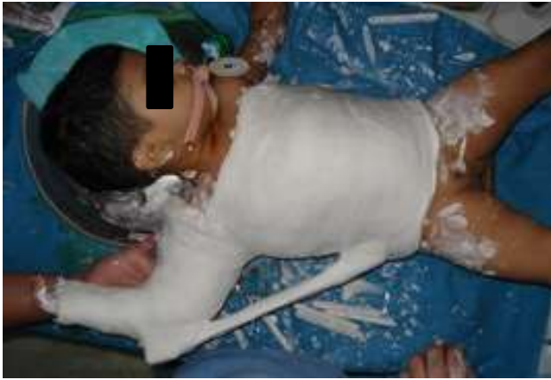
Figure 1: Post op immobilization in spica cast.

All the children in our series were evaluated by modified Mallet scoring system. The average scores were 2.87 and 1.5 for upper and whole arm type respectively.