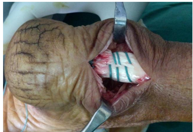
Fig. 4: Operative photograph of Achilles tendon repair with suture anchor. Normal heel cord contour is restored.

The patients were evaluated by American Orthopaedic Foot Ankle Society (AOFAS) Ankle-Hindfoot scale. 6 It is a 100 point score with 40 points for pain, 50 points for function and 10 for alignment. Functional evaluation by