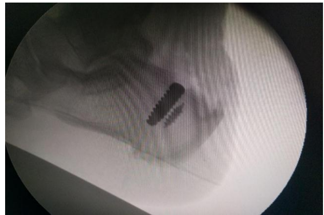
Figure 3: IITV image showing an interference screw in the calcaneum to fix the FHL tendon. Behind this, suture anchor for Achilles tendon repair can be seen.