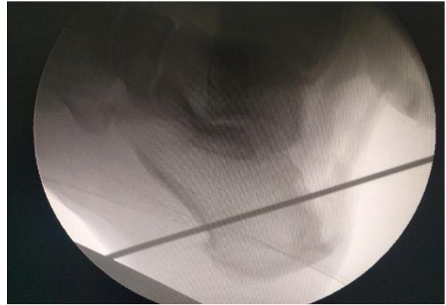
Figure 2: Image showing the beath pin passed in the intended direction of calcaneal tunnel.