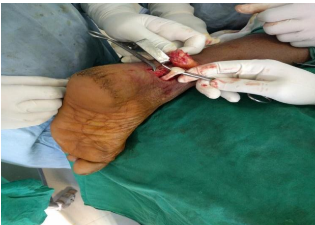
Figure 1: Photo showing the Achilles tendon tear and the FHL tendon pulled out which is flexing the great toe.

The Achilles tendon was exposed by a posteromedial incision extending upto 1 cm below the calcaneal insertion. Paratenon was carefully incised and sural nerve was identified and retracted. Tendon ends were debrided to remove calcifications. If there was a prominent posteromedial calcaneal tuberosity, it was excised. FHL was dissected out protecting the neurovascular bundle (Figure 1). The FHL tendon was pulled up as far as possible with simultaneous plantar flexion of ankle and first toe. It was transected at the level of calcaneum. A bone tunnel was drilled in the calcaneum starting at the superior calcaneal tuberosity and going in an anteroinferior direction and exiting at the plantar aspect of heel (Figure 2). A Krackow stitch is taken at the end of FHL tendon. The tendon is pulled into the calcaneal tunnel and securely fixed with an interference screw of same size as the tunnel diameter. Then a suture anchor is deployed at the insertion site of Achilles tendon (Figure 3). Suture threads of the anchor are passed through proximal end of Achilles tendon and tied. The Achilles tendon repair was not in excessive tension (Figure 4). If a large gap was present at rupture site, it was dealt with by pie crusting of the gastrosoleus fascia. This was enough to bring the Achilles tendon down to the calcaneal insertion. Paratenon is meticulously closed over the repair followed by skin closure.