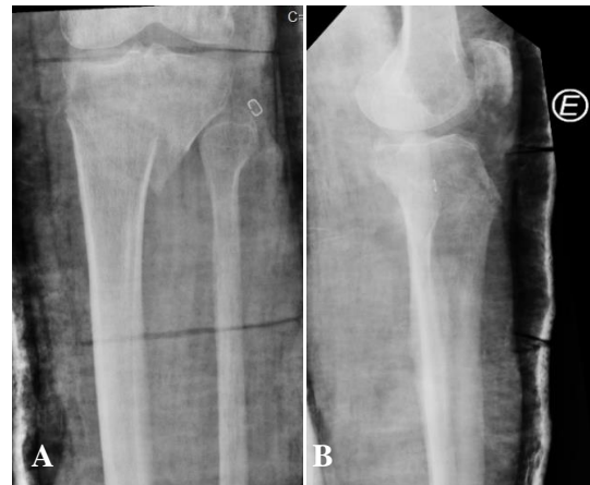
Figure 3: (A) AP radiograph 4 weeks later, it revealed an additional 4 mm lateral displacement, and 3 mm tibial shortening; (B) Lateral radiograph 4 weeks later.