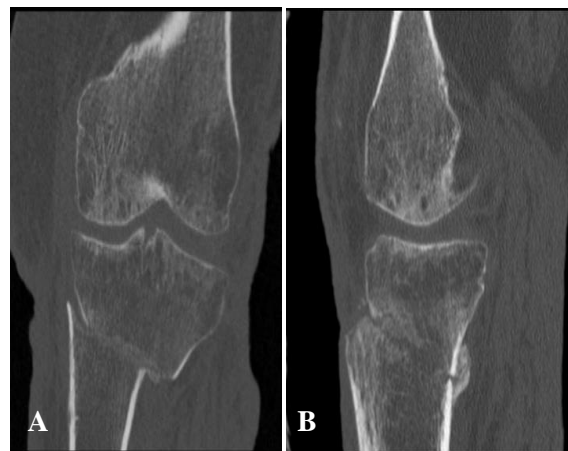
Figure 4: (A) AP, CT Scan 3 months later, showed some signs of fracture healing; (B) Lateral, CT Scan 3 months later, showed some signs of fracture healing.