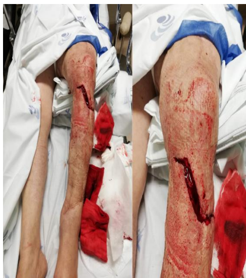
Figure 1: Emergency room: Left tibial open fracture (gustillo-anderson type- II with bone extrusion and poor quality of soft tissues (scarring and fibrosis)).

The patient was discharged with indications for crutch walking and non-weight bearing. For the first month, radiological control (AP and lateral radiographs) was done weekly and after that, monthly in outpatient clinic. After 4 weeks, radiographs revealed an additional 4 mm lateral displacement, and 3 mm tibial shortening (Figure 3), remaining stable since then. At 3 months, a computed tomography (CT) scan was performed, showing some signs of fracture healing (Figure 4). The cast and indications for non-weight bearing were maintained and at 6 months a new CT scan was done, revealing fracture consolidation (Figure 5). The cast was changed to an articulated knee orthosis, the patient started walking with partial weight bearing at this stage and began physical therapy. One year after the injury, the patient has minimal pain, needs one crutch for walking, has a 0-90° knee range of motion and no soft tissues complications (Figure 6).