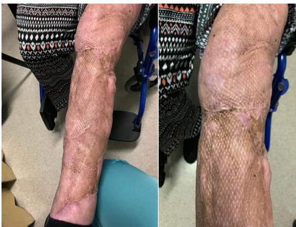
Figure 6: Soft tissues appearance 1 year later without wound complications.