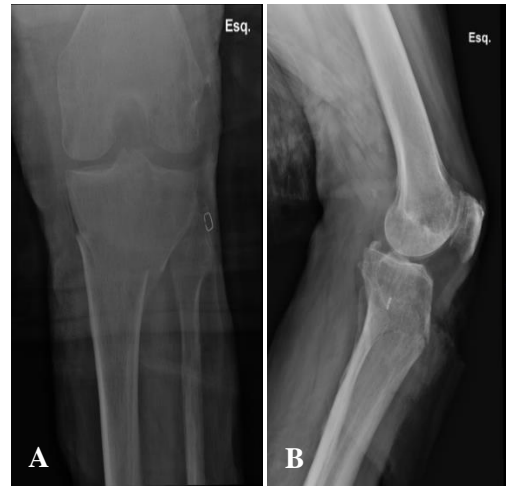
Figure 2: (A) AP radiograph showing 15 mm fracture displacement (B) Lateral radiograph showing a fracture without displacement.