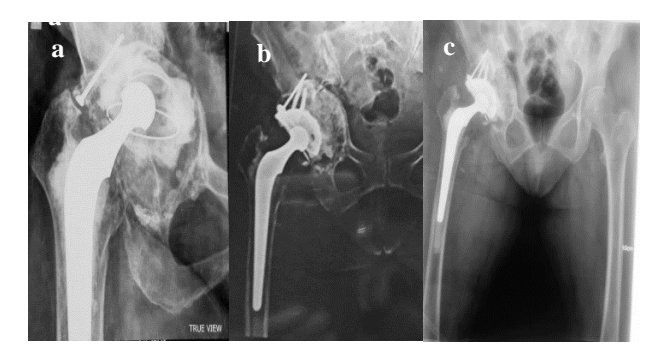
Figure 4: (a) Pre-operative X-ray of a failed THR showing a failed and mal positioned acetabular cup, (b) post-operative X-ray (at 3 months) of revision THR (4 head of the femur and 1 TKR slice used), and (c) post-operative X-ray (at 6 months) of revision THR showing good integration of the impacted morselized allograft in the cavitatory acetabular defect.

This infected surgical site was debrided with a thorough lavage along with the removal of all the pieces of the bone allografts. The intraoperative deep tissue pus culture report showed no growth of any organism and the biopsy report was acute on chronic inflammation. Subsequently, the wound healed satisfactorily within 4 weeks with no recurrence of infection.