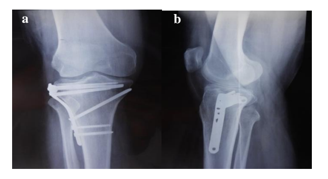
Figure 3 (a and b): Post-operative X-ray AP/lateral views at 6 months after bone grafting and plate fixation.