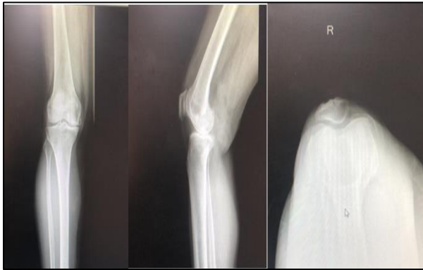
Figure 1: Pre-operative radiographs of right knee.

trauma to left knee in the past. Initial baseline investigations and inflammatory markers were done to rule out any infection. She underwent cemented total knee arthroplasty under spinal anesthesia with tourniquet throughout (Figure 2).