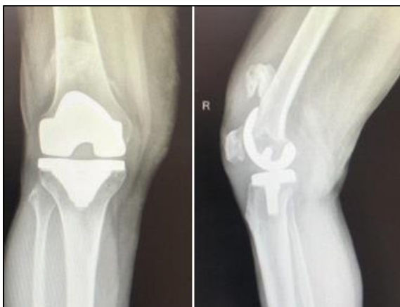
Figure 3: Radiographs at 12 weeks follow-up.

The standard medial parapatellar approach was used and was performed by an arthroplasty surgeon who has more than 20 years' of experience. Intraoperatively, there was no significant soft tissue injury. Minor dissection was performed and complete hemostasis was obtained. Post-