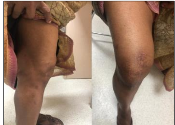
Figure 4: Clinical pictures at 8 months follow up.

operative period was uneventful; drain was minimal, no postoperative knee effusion was there. Full weight bearing mobilization and range of movement exercises were allowed since the first postoperative day. While doing surgery, her bones were found to be very osteoporotic during bone cuts hence was advised teriparatide injection and calcium postoperatively. She was discharged safely on the third postoperative day.