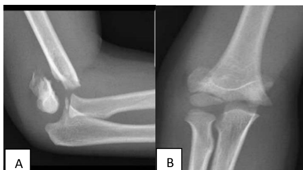
Figure 1: Radiograph of the elbow showing Gartland type III fracture. (A) Lateral view, (B) anteroposterior view.