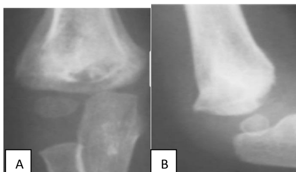
Figure 4: Radiograph of a united displaced supracondylar fracture after fixation with two lateral Kirchner wires at follow up. (A) Anteroposterior view, (B) lateral view.