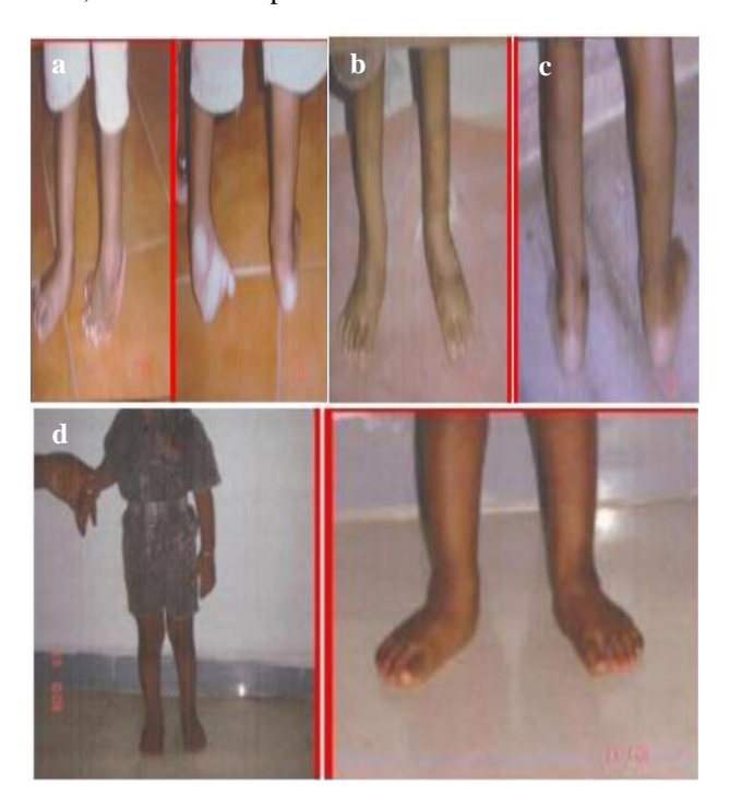
Figure 2: (a) Pre-operative, (b) 3 months follow-up, (c) 6 months follow-up and (d) 1 and half year's follow-up good correction.

The results of our study were good in 71%, fair in 19%, poor in 10%. Turco has a result of excellent and good in 86%, fair in 9% and poor in 5%.8