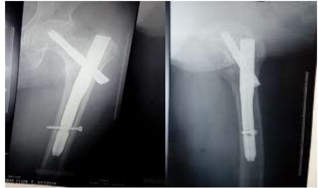
Figure 4: X-ray showing osseous union at fracture site.