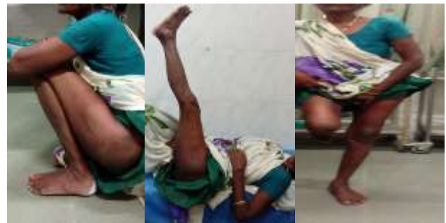
Figure 5: Clinical photographs showing full range of movements achieved.