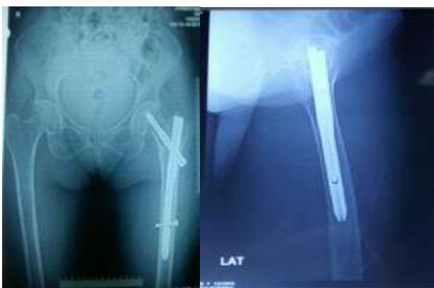
Figure 3: Immediate postoperative X-ray showing internal fixation with PFNA.