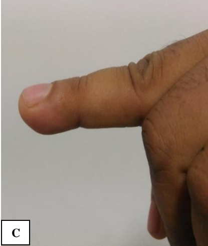
Figure 2: (A) Radiographs showing mallet fracture of the ring finger; (B) Postoperative radiograph showing anatomical reduction after wire removal; (C) Clinical photograph of full extension of the DIP joint at 3 months after follow up.