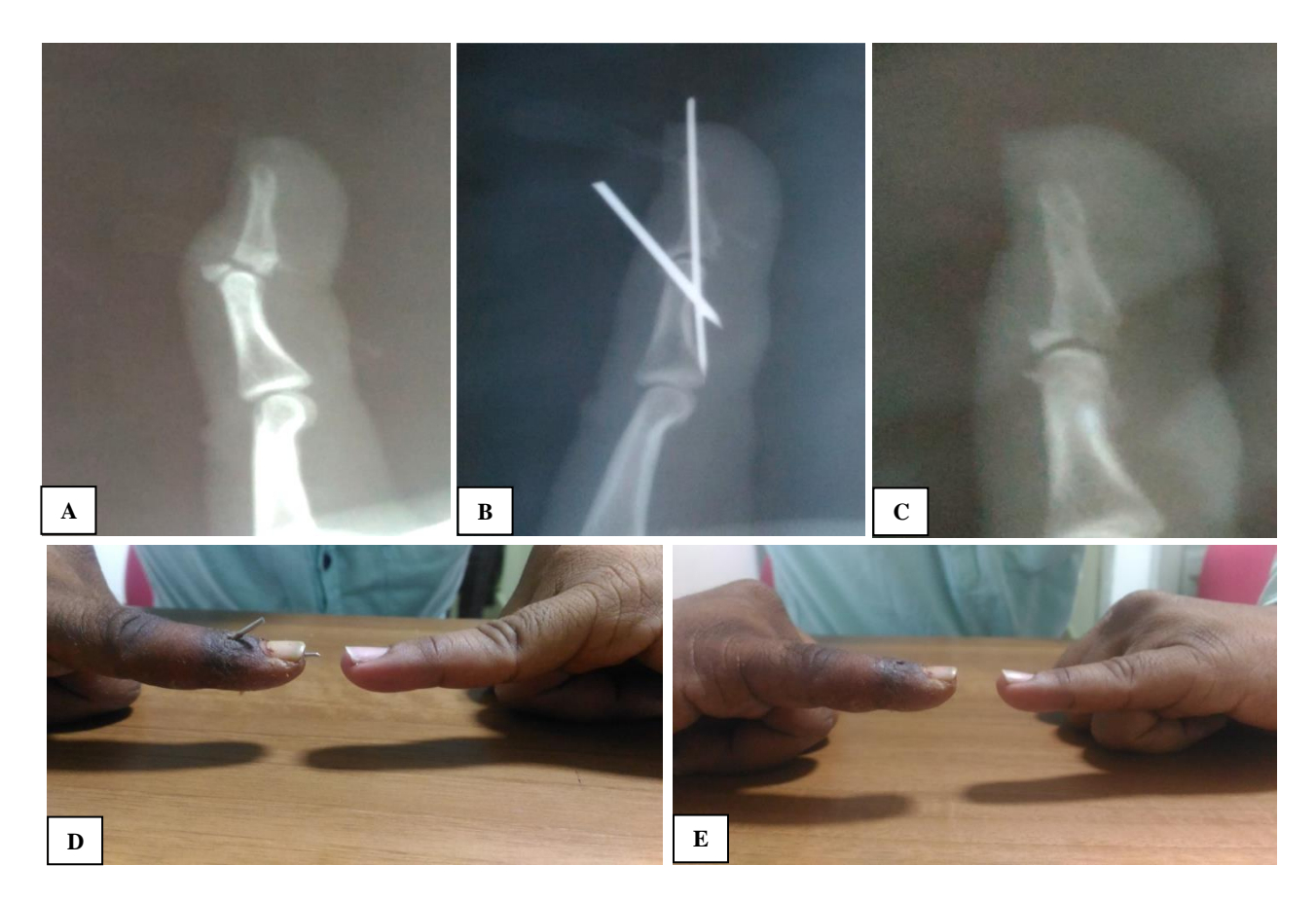
Figure 3: (A) Radiographs showing mallet fracture of the little finger; (B, C) Postoperative radiograph showing anatomical reduction of the fracture; (D) Clinical photograph of full extension of the DIP joint at 6 weeks follow up (E) Full extension maintained after wire removal (d).