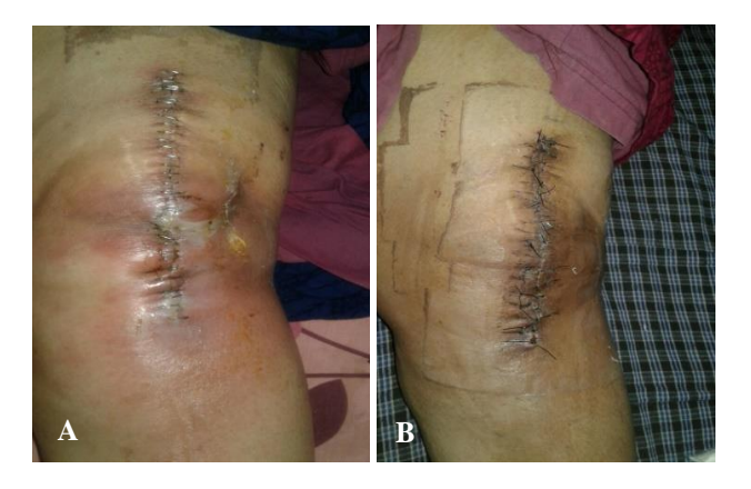
Figure 3 (A and B): Post-operative complication (infection).

Disposable drapes were used to reduce the infection rates. Anterior midline incision of 8-10 inches was taken. Skin flaps were elevated. Soft tissue dissected. Medial parapatellar arthrotomy was done. The patella is subluxed outside the knee area. First with an intramedullary jig distal femoral cut is taken of about 8-9 millimetres. The knee is extended and the spacer is kept near the proximal tibia and marked with the help of a cautery. Then the knee is flexed 90 degrees and tibia is subluxated with the posterior spike carefully placed over the posterior