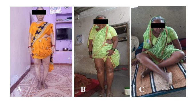
Figure 2: (A) 12 months post-operative clinical picture of unilateral TKA, (B and C) 12 months postoperative clinical picture of a lady with bilateral TKA done.

Figure 1: TKA done in a 70 year old severely osteoarthritic patient (A) patient with bilateral genu varus (B) pre-operative antero-posterior X-ray of both affected knees (C) pre-operative lateral X-ray of both affected knees (D-F) Intra-operative images of the procedure (G) post-operative antero-posterior and lateral X-ray of right knee (H) post-operative anteroposterior and lateral X-ray of left knee (I) postoperative clinical picture of the patient with corrected varus deformity.