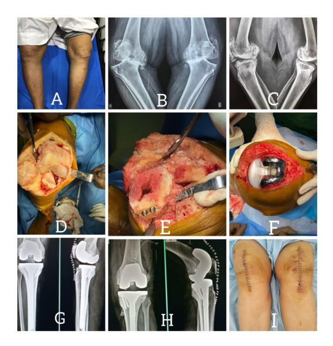
Figure 1: TKA done in a 70 year old severely osteoarthritic patient (A) patient with bilateral genu varus (B) pre-operative antero-posterior X-ray of both affected knees (C) pre-operative lateral X-ray of both affected knees (D-F) Intra-operative images of the procedure (G) post-operative antero-posterior and lateral X-ray of right knee (H) post-operative anteroposterior and lateral X-ray of left knee (I) postoperative clinical picture of the patient with corrected varus deformity.

4.5 grams (2.25 grams if renal impairment) intravenously or injection linezolid 600 milligrams intravenously) was administered once the night before (12 hours prior to surgery) and the second dose 30 minutes prior to incision. Shaving of skin hair over surgical site was done 10 minutes before surgery. Foley's catheterization was done. Patient was positioned supine with hip and knee flexed to 45 degree. The procedure was carried out under spinal anaesthesia with or without epidural. Tourniquet was applied. Painting of surgical site was done with betadine scrub (7.5%).