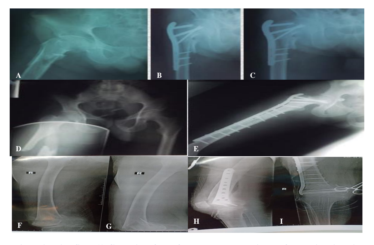
Figure 3: Radiological films, (A-C) proximal femur fracture has occurred in one of our patient, in which preoperative and post-operative radiological images were take. (D and E) diaphyseal femur fracture has occurred in one of our patient, in which pre-operative and post-operative radiological images were taken and (F-I) distal femur fracture has occurred in one of our patient, in which pre-operative and post-operative radiological images were taken.