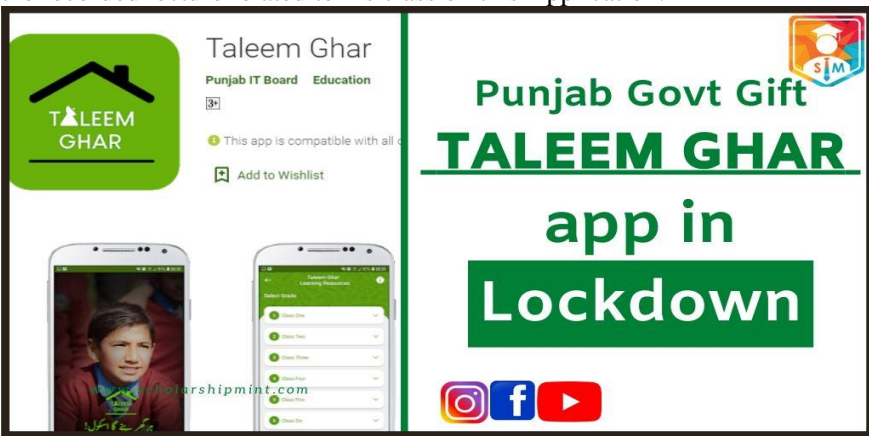
Figure.1: Pictorial view of Taleem Ghar App

The public and private schools were also closed during the Pandemic COVID-19. So, a great challenge has been faced by the Primary, Secondary and Higher secondary (K2) school's students. The Government of Pakistan has taken the steps to compensate the loss of these student by launching an application called as "Taleem Ghar". This application delivers recorded lectures of different classes including K2 in different times. It was the good initiative of Government of Pakistan. Now every student can watch the recorded lecture related to his class on this Application.