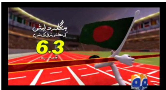
Figure 3: Frame at 30:00 sec

In the frame given in figure 3, Bangladesh is shown while winning the race of economic condition. Such animations and pictures are used in the ad which gives an impression of race and competition among different countries.