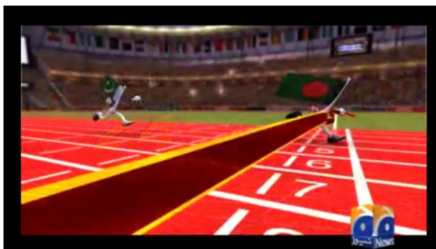
Figure 4: Frame at 00:60 sec

In figure 4, race of economic condition is shown between Bangladesh and Pakistan. Bangladesh is winning this race as its economic condition is better than Pakistan.