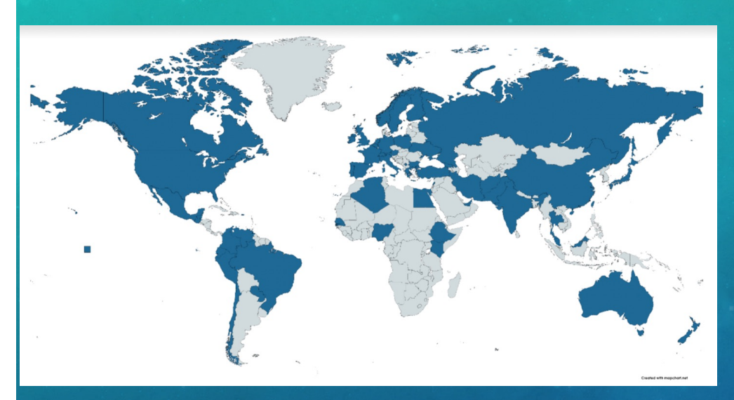
<u>Figure 1</u>- MedNews Week global attendance.