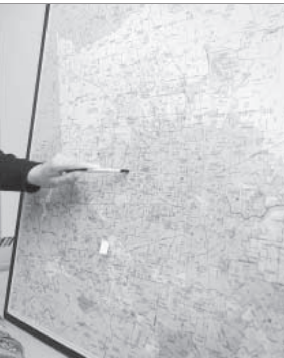
study a map showing the demographics of the no directs the Center for Research on Minority Health and exercise on breast cancer risk in premenopausal

searchers hope to complete telephone interviews with 400 Chinese-American and 400 Vietnamese-American households by the spring of 2003. The data gathered through the surveys will be analyzed and shared with the Asian-American community and with the Texas Department of Health and other health-care organizations. The results should reveal what types of health education programs are needed and suggest areas for further research. Having the baseline data should also, according to Dr. Gor, make it easier for community groups to gain funding for health-related research.