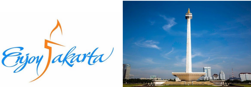
Figure 4. Jakarta – Enjoy Jakarta (2004)